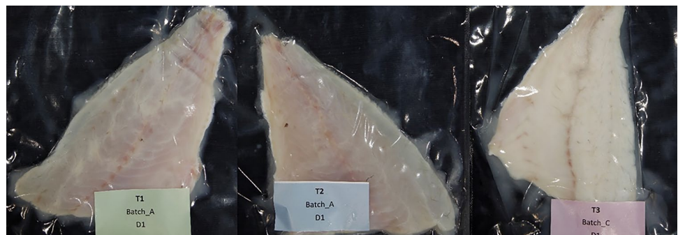
Fig. 2 Pictures of fish fillets. T1, T2, and T3 correspond to the marination control (MC), vacuum impregnation (VIM), and vacuum impregnation followed by the pressurization at 250 MPa for 6 min (VIM+HHP) samples, respectively

throughout the storage period. This finding agrees with other studies that have attributed this whitening effect to protein changes, leading to an increase in light reflection (Giannoglou et al., 2021; Oliveira et al., 2017). However, mackerel pressurized at 150 MPa for 2.5 min or coho salmon pressurized at 200 MPa for 30 s had no effect on lightness after processing (Aubourg et al., 2013a, b). Lightness was unaffected during the storage of non-pressurized samples (MC, VIM), whereas VIM+HHP samples showed a tendency toward darker colors. It is unclear whether this effect was caused by the browning of heme pigments and the progression of lipid oxidation